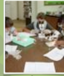
May 5th, 2010