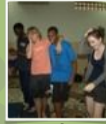
Jan. 29th, 2010 vol 6.8